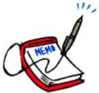
Figure 3B5-1 Assessment Activity Map

All points are located in the lower right-hand corner. To clearly identify the designated points and terrain features, Figure 3B5-1 is best viewed in colour.